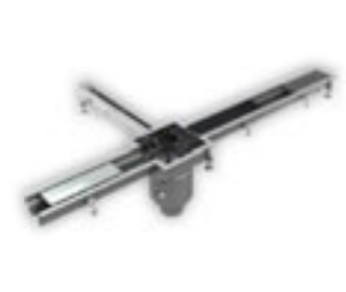
Stainless steel channels