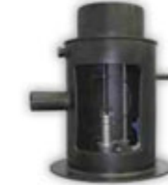
PE pumping stations